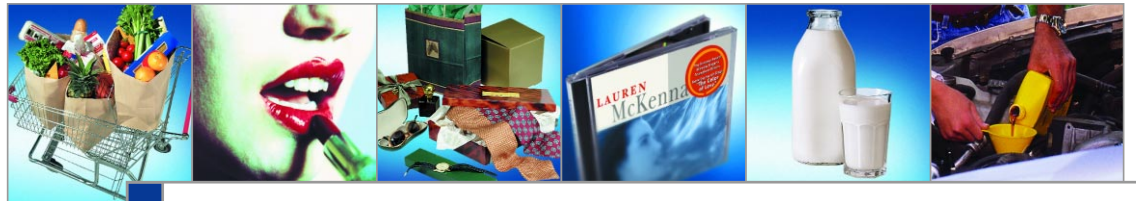
Auto Splice Dual Unwinder With Binbox